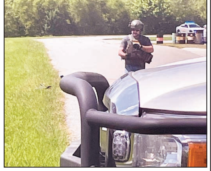
A member of the GBI Bomb Disposal Unit after affixing X-ray equipment to a suspicious device found off Commerce Way July 28.

Responding in Blairsville were the Union County Sheriff's Office, Union