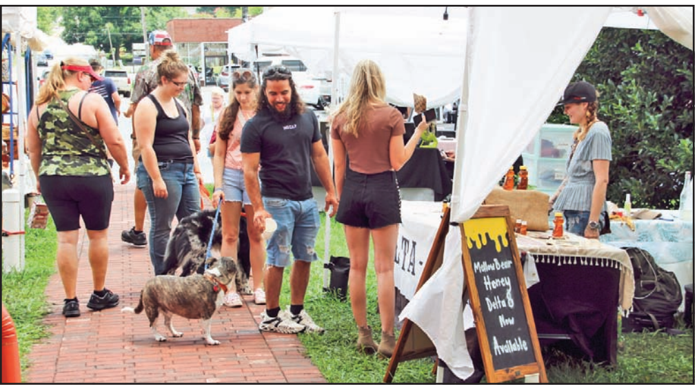
The Music & Moonshine Festival inspired a robust attendance at the Old Union County Courthouse, with many vendors and small businesses well supported via excellent sales figures July 29-31.

Moonshine Passport Drink Tour, the live music kept festival patrons entertained throughout as they boosted both the bottom line of local merchants as well as the tax base.