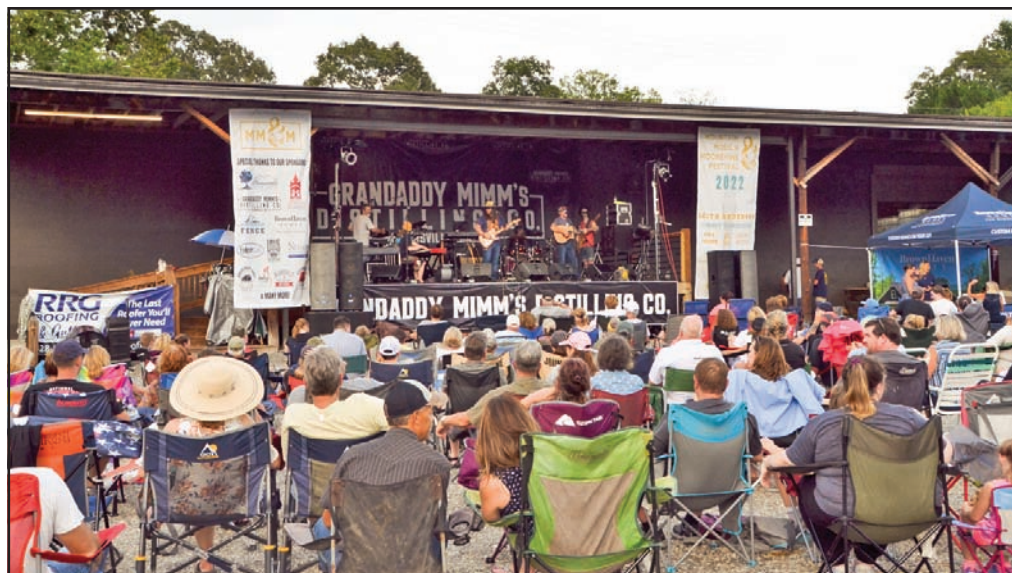
Grandaddy Mimm's Distillery offered a terrific venue for live music over the three days of the Mountain Music & Moonshine Festival.

On top of the free tastings at multiple booths with the See Music & Moonshine, Page 6A